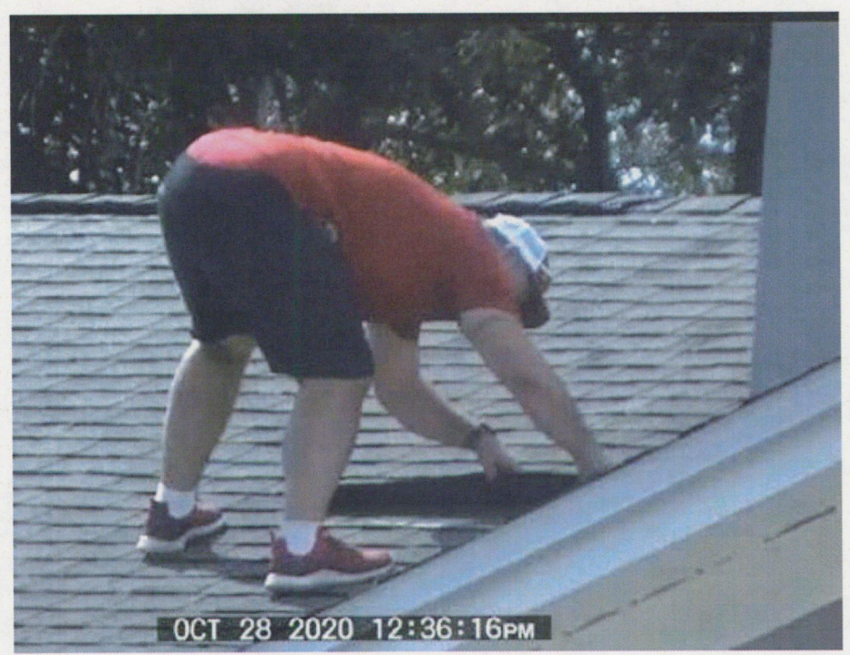
Page 22 of 34